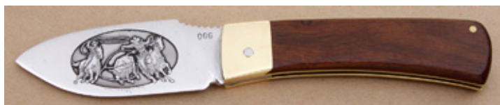
Bob Ogg - Slip Joint Folder

Folder, 3 1/2" Blade, Cocobolo Wood Handle Scales, Brass Bolsters, Brass Liners, 4 1/2" Closed, Pre-owned. Not used or carried. Etching on front of blade by Shaw-Leibowitz in 1972. Mirror polish on blade. Serial #82. No pouch.