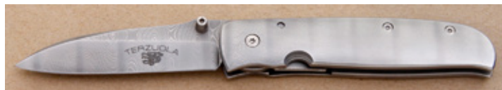
Bob Terzuola - Linerlock

Folder, 2 3/8" Blade, Damascus Steel, Damascus Handles, Titanium Liner, 3 1/4" Closed, Pre-owned. Not used or carried. No pocket clip. Brown felt pouch.