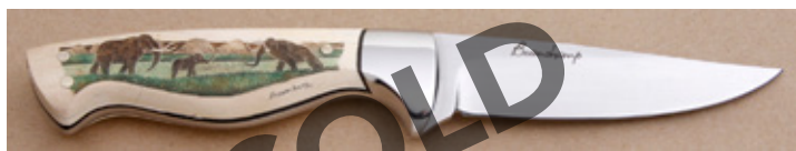
Gaeton Beauchamp - Hunter

Fixed Blade, Full Tang, 3 3/4" Blade, ATS-34 Stainless Steel, Mammoth Ivory Scales, Stainless Bolsters, Black Liners, 8" Overall, Pre-owned. Not used or carried. Satin finish on blade. Back scale has some bark showing. Front scale has scrimshaw of mammoths grazing in field. Front scale has some cracks along the bottom close to liner and at the front pin. Does not come with a sheath but does come with a zipper pouch.