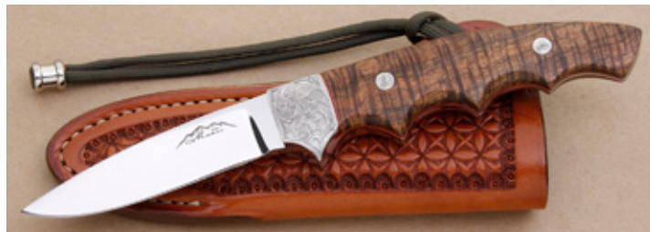
Jerry Moen - Hunter

Fixed Blade, Finger Groove Handle, Full Tapered Tang, 3 5/8" Blade, Curly Koa Wood Scales, Stainless Bolsters, Red Liners, 8 3/4" Overall, Pre-owned. Not used or carried. Mirror polished blade. Bolsters and pins engraved by Kevin Elkins. Comes with a handmade and hand tooled brown leather sheath.