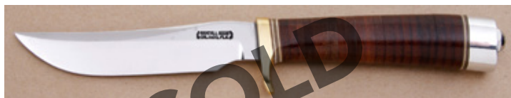
Randall Knives - Model 7 Hunter

Folders do not include a pouch unless so indicated.